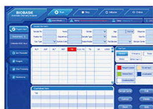
Software User-friendly software.