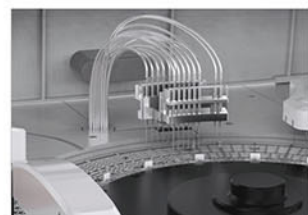
Washing Probe Dual design, high efficiency.