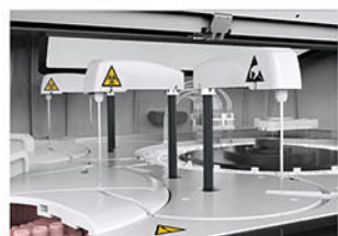
Sample/Reagent Probe Liquid level sensor function. Anti-collision function. Sample volume real-time detection.