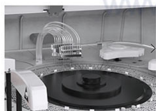
Reaction Tray 37±0.1°C, water bath.