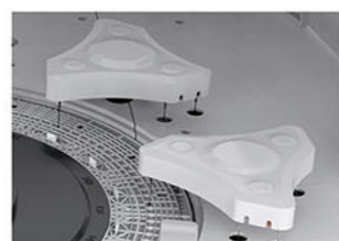
Mixer Probe Dual mixer, auto frequency adjustment.